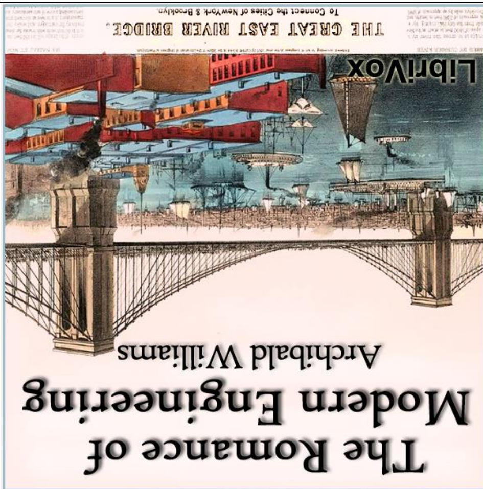
Image: Artists' conception, by Currier and Ives , of the Great East River Bridge (later renamed Brooklyn Bridge) while construction was underway, 1872 Cover design for Librivox by Michele Fry

Print Page 3 on regular or 20 lb bond paper for ease of folding.